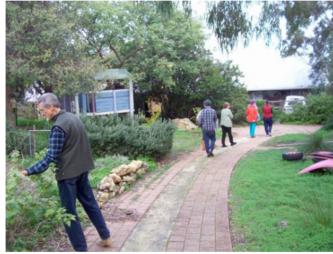
The tour of Freo Fringe housing co-op.