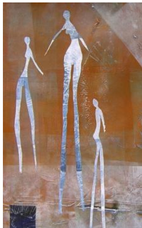
A favourite artwork - 'The Family'